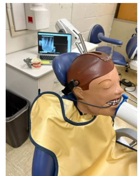
New digital X-Ray equipment and software