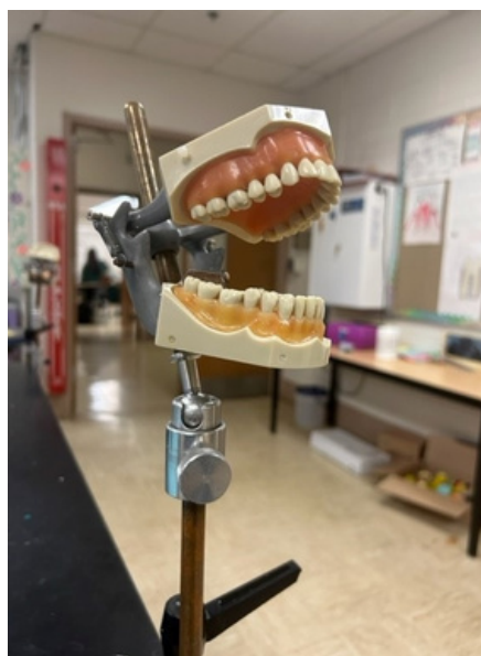
Teeth and jaw model set