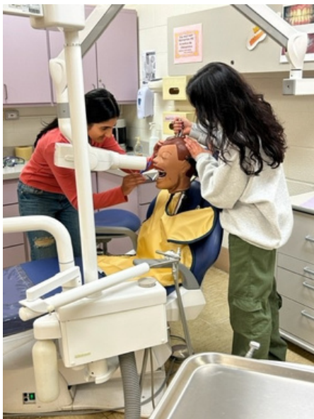
Students practice taking X-Rays