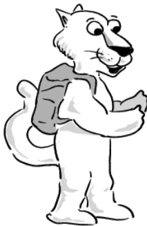
George T. Cromwell Elementary School

Thank you in advance for completing this important form.