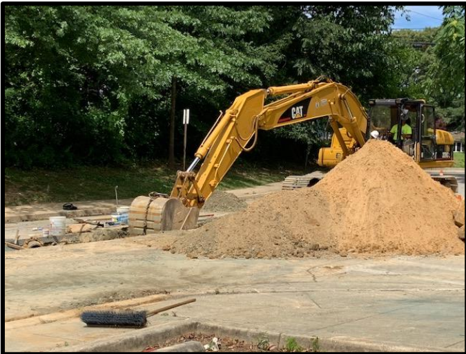
Water Line Installation