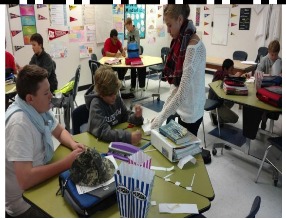
Investigación y Colaboración en el 7º Grado