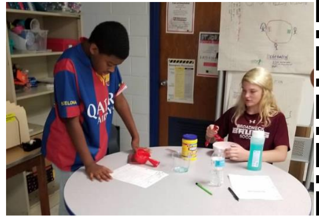
Inquiry and Collaboration in 8 th Grade AVID