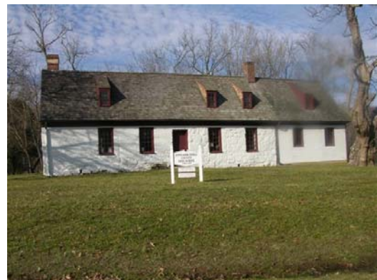
As It Looks Today