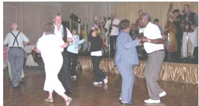
After dinner entertainment was provided by the Zydecats.