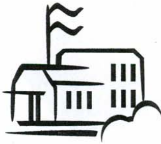
Windsor Farm Elementary

Incoming 6th Grade Parent Information Night